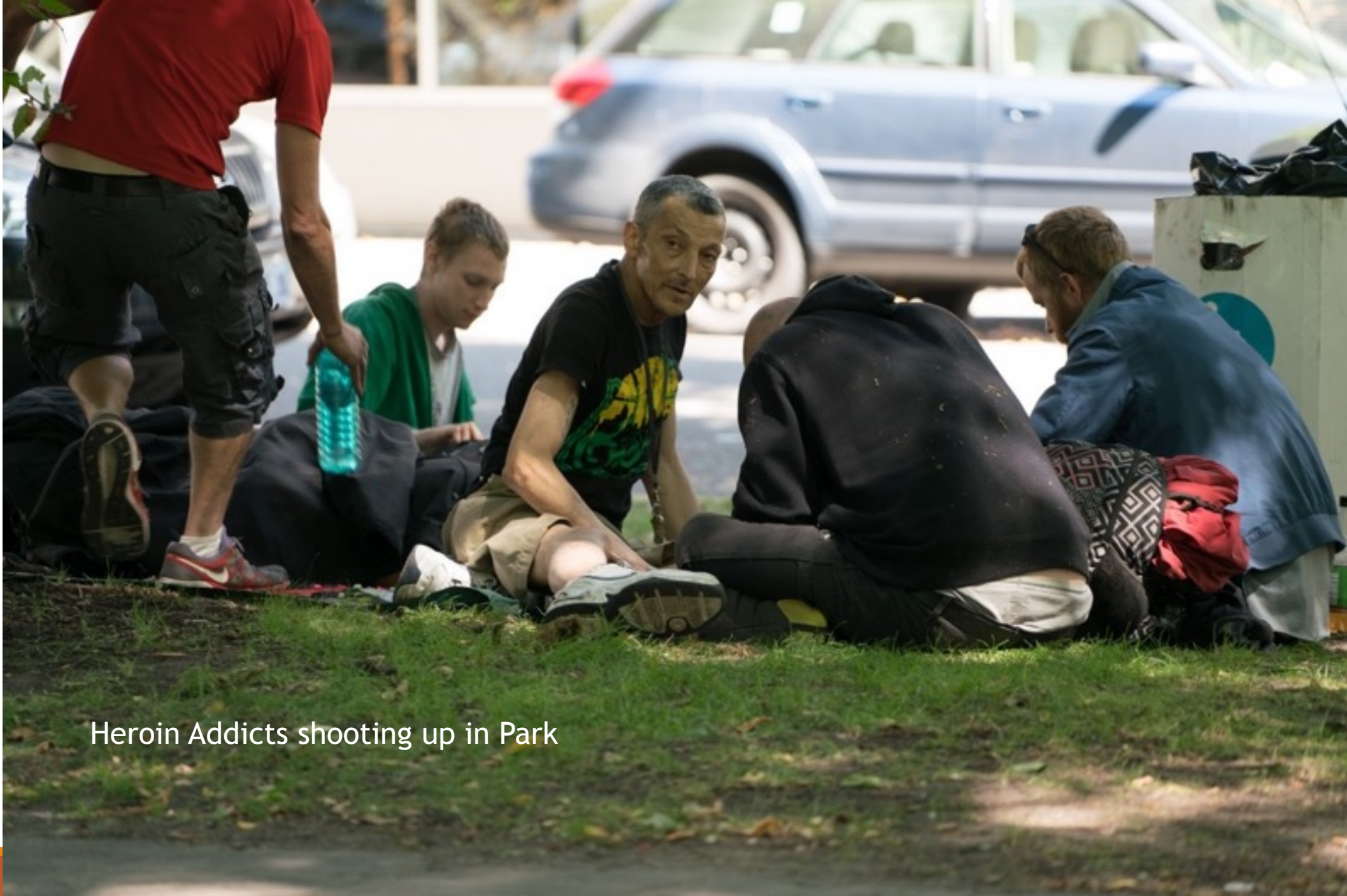
Heroin Addicts shooting up in Park