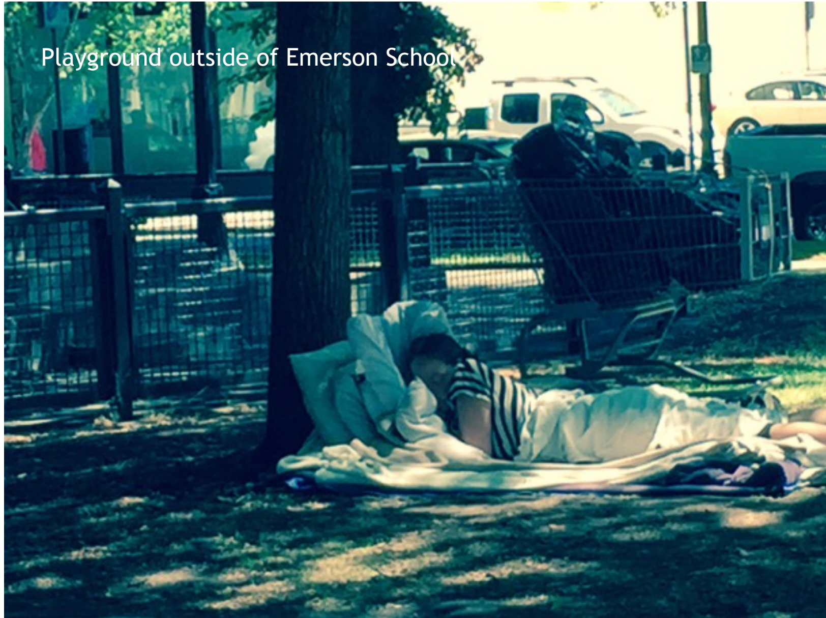
Playground outside of Emerson School