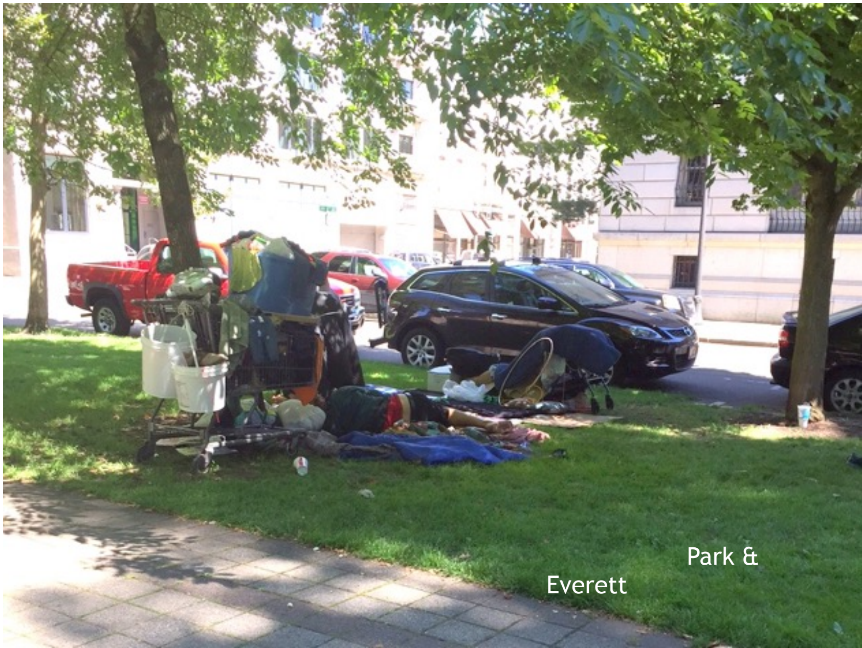
Park & Everett