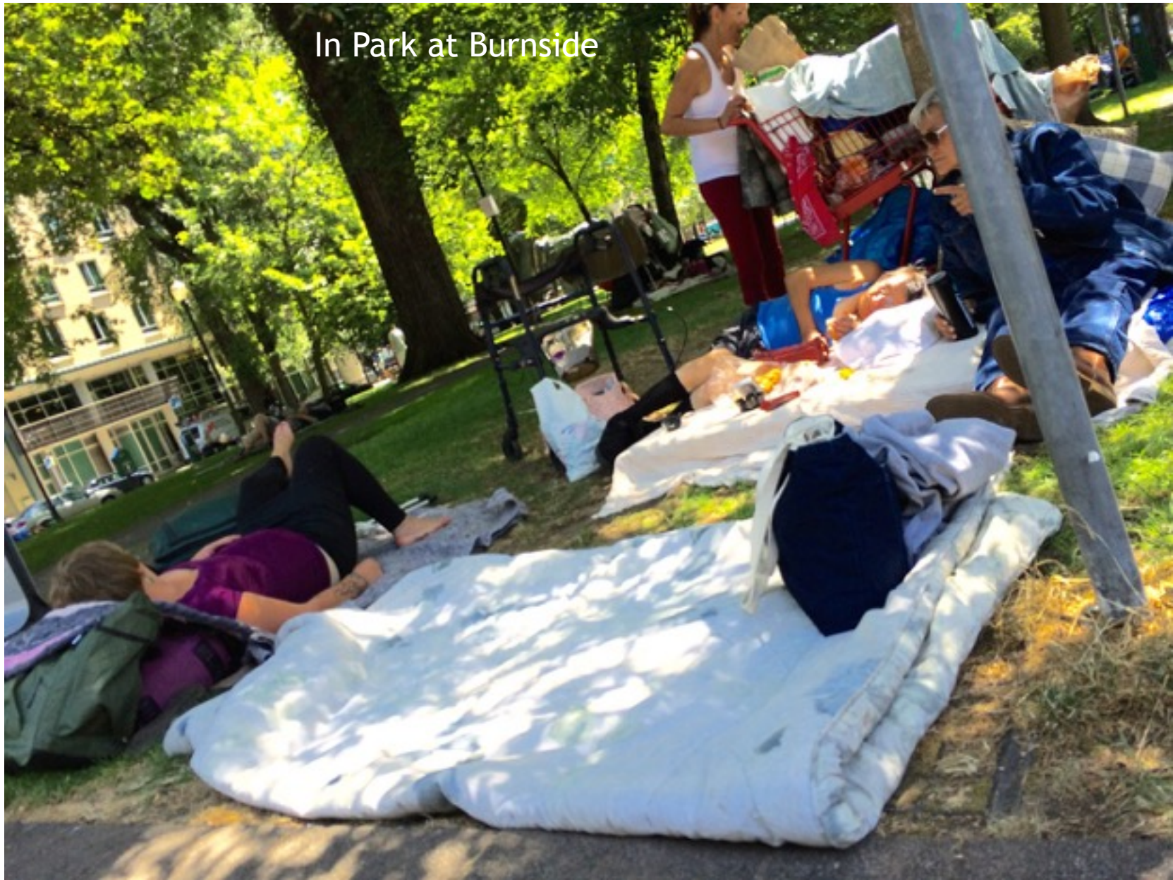
In Park at Burnside