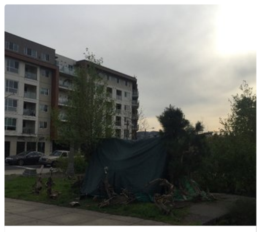
Legal, free tent camping complete with yard ornaments! Who needs a luxury condo?